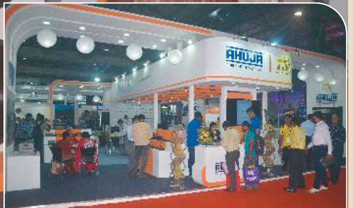
View of the Ahuja Stall