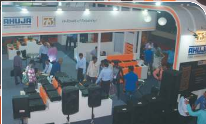
View of the Ahuja Stall